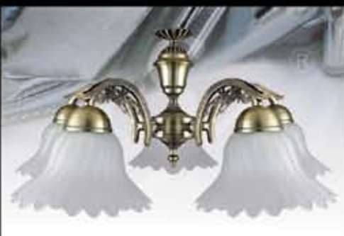
五金飾品 Metal accessories