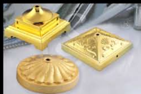
波麗燈座 Poly lamp holders