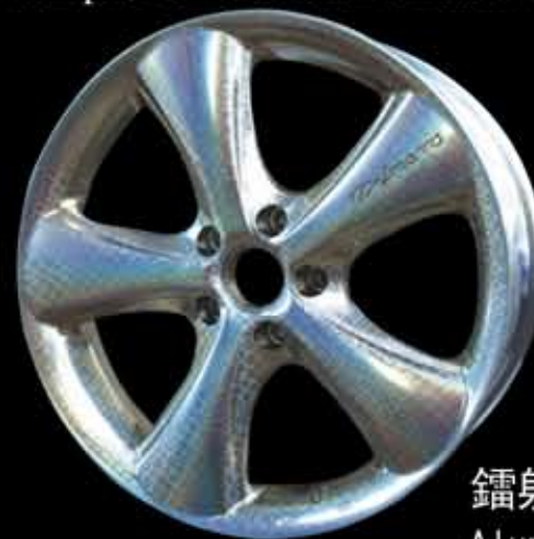
鐳射汽車鋁圈 Aluminium Rim