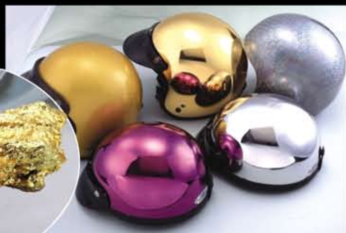
頭盔ABS ABS Helmets