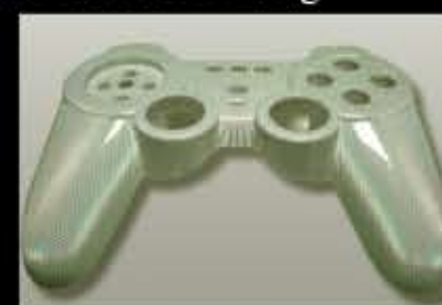
ABS遊戲機搖桿 ABS Joystick