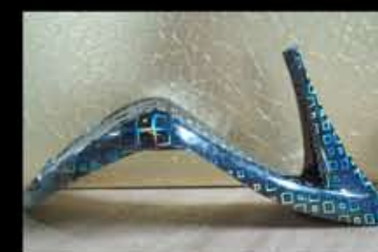
ABS鞋底 ABS Sole