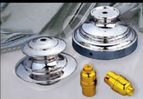
五金電木燈飾 Metal phenolic lampholders