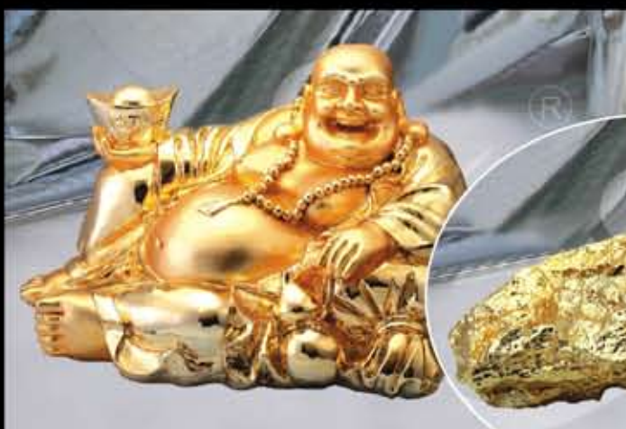
波麗工藝品 Poly artwork