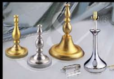
五金飾品 Metal accessories